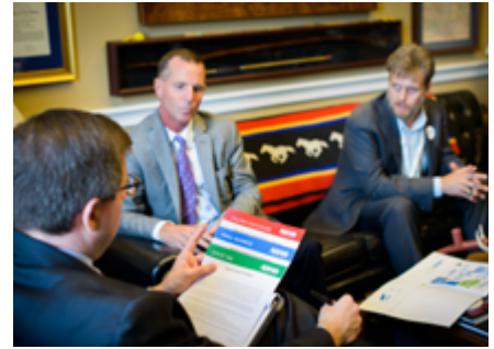
More personal and in-depth dialogue were the hallmarks of NAMA's 241 meetings on Capitol Hill.